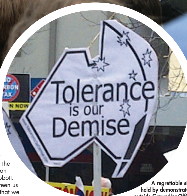
A regrettable sign held by demonstrators outside Grayndler Office.

Anthony argued that the Government had the same target for carbon reduction as Tony Abbott. "The difference between us and the Coalition is that we want to tax the big polluters and