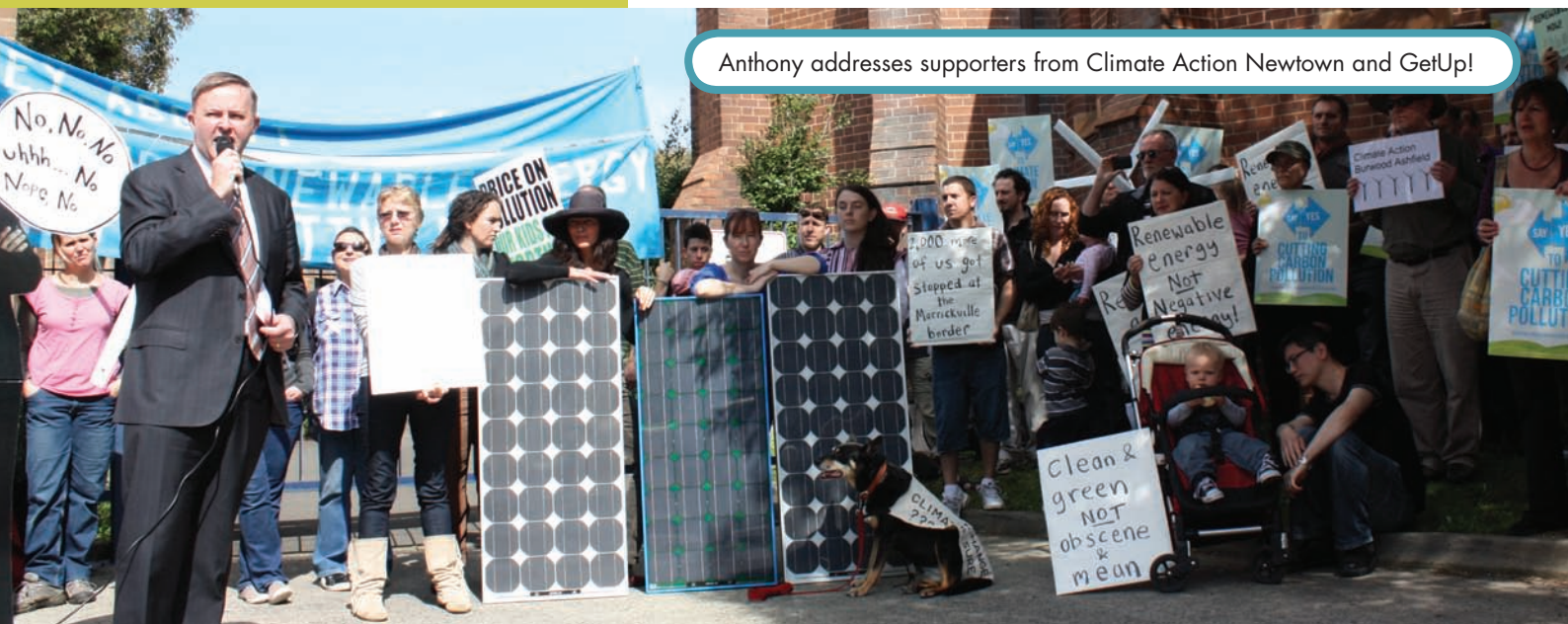
Anthony addresses supporters from Climate Action Newtown and GetUp!

Quoted by Anthony Albanese in his first speech in Parliament Hansard 6 May 1996